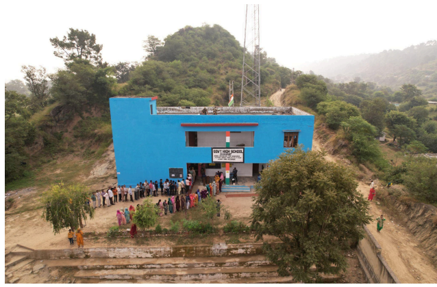
Border Polling stations in 84 Nowshera AC in Rajouri district