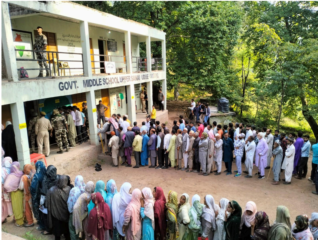
Voters in Poonch District, Jammu-Kashmir