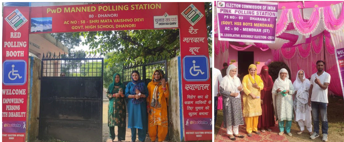
Pwd manned PS no 80 Dhanori, AC-58 ShriMata Vaishno Devi & women managed PS

The Dal lake provided a scenic backdrop for the polling festivities. Voters reached their polling stations aboard the iconic Shikara to cast their vote. Voting took place in a tranquil atmosphere free of fear and intimidation. Voters inhabiting the areas near the border were also empowered to exercise their franchise at 55 Border Polling Stations set up near the LoC in 89 Poonch Haveli and 90- Mendhar AC in Poonch district and 51 such polling stations in Rajouri district. These Border Polling Stations saw voting today in line with the Commission's resolve to bring even the remotest corners of the country into the democratic fold.