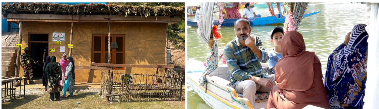
Border PS 1 Noorkot, 89 Poonch Haveli AC and voters going by Shikara at Dal Lake

The Dal lake provided a scenic backdrop for the polling festivities. Voters reached their polling stations aboard the iconic Shikara to cast their vote. Voting took place in a tranquil atmosphere free of fear and intimidation. Voters inhabiting the areas near the border were also empowered to exercise their franchise at 55 Border Polling Stations set up near the LoC in 89 Poonch Haveli and 90- Mendhar AC in Poonch district and 51 such polling stations in Rajouri district. These Border Polling Stations saw voting today in line with the Commission's resolve to bring even the remotest corners of the country into the democratic fold.