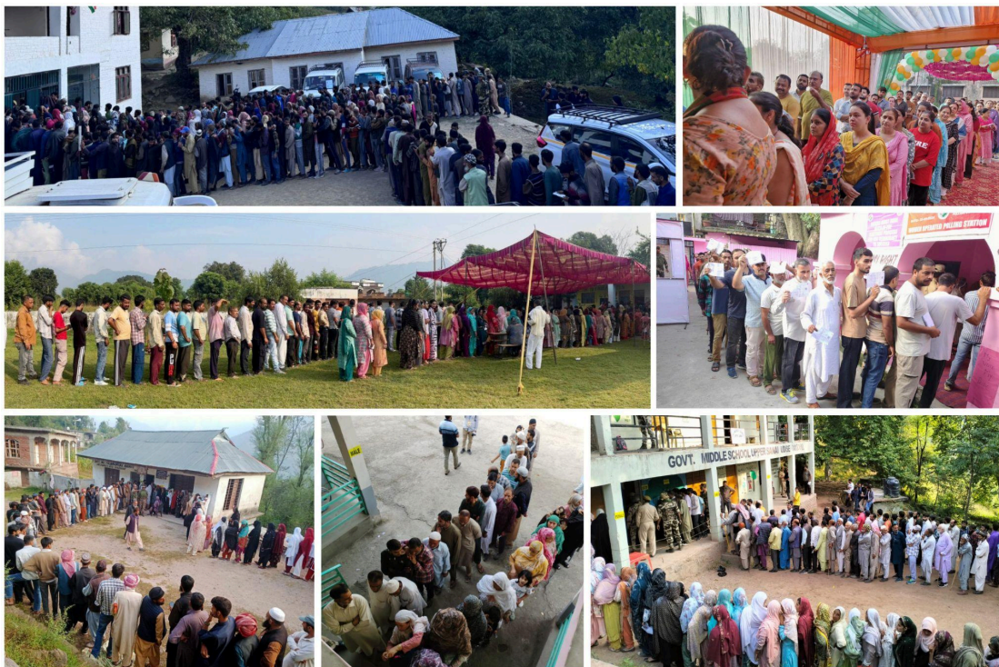
Voters queuing up at polling stations in second phase of J&K elections

In the penultimate phase of the elections to the Jammu-Kashmir Legislative Assembly, voters queued up in long lines at the Polling Stations dotting the picturesque landscape and carried forward the momentum witnessed during Phase-1. Voting across 26 ACs which commenced at 7 AM today was held peacefully without any incidents of violence. As of 7 PM, a voter turnout of 54.11% was recorded at the polling stations. The overall voter turnout recorded in these six districts that went for polls in Phase 2 have also surpassed the turnout recorded in Lok Sabha Elections 2024. Phase-1 of the Jammu-Kashmir Assembly elections had also witnessed an encouraging response by voters with a voter turnout of 61.38% at Polling Station across 24 ACs.