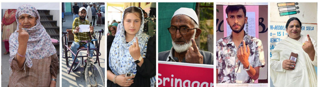
Voters across age groups displaying their inked fingers

Young voters reflected the aspirations of peace, democracy and progress as first time voters proudly showcased their inked fingers after voting. A total of over 1.2 lakh electors are in the age of 18-19 for phase 2.