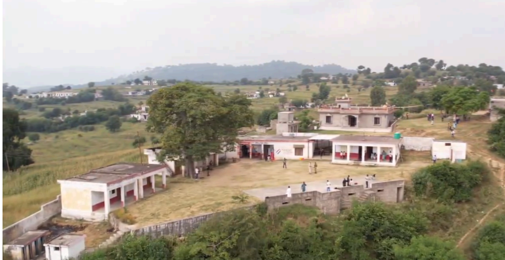
Border Polling Station 84-Nowshera, situated less than 1 Km away from the Border

Kashmiri Migrant voters were also empowered to exercise their franchise through 24 Special Polling Stations setup in Jammu (19), Udhampur(1) and Delhi (4). Earlier, the Commission had eased the process for Kashmiri migrant voters by abolishing the cumbersome Form-M and enabling self-certification.